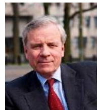
Prof. mr. Jaap de Hoop Scheffer Professor International Relations and Diplomatic Practices at Leiden University

"From my own experience, I can tell: public leadership matters, really makes the difference. Therefore it is vital to invest in leadership development. Especially now, in these times of uncertainty and global challenges. With the Leiden Certified Public Manager® Program we offer a new approach, based on a proven US concept, unique in a European context."